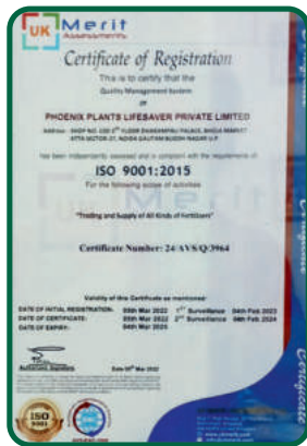
1. ISO 9001:2015 (Quality Management System)

We have received prestigious accreditations with respect to our quality assurance, plants manufacturing practices, environments safety management. We do ensure our company adherence towards all norms and compliance.