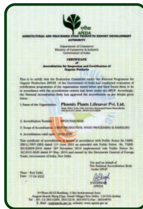
5. Organic certification (under NPOP Standards) (By NOCA. A certifying agency approved by APEDA, Government of INDIA.)