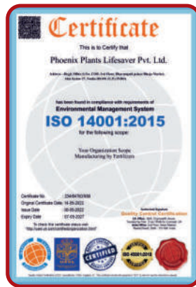
2. ISO 14001:2015 (Environment Management System)