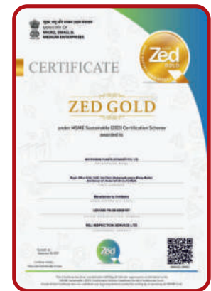
6. ZED Certified Zero Defeat Zero Effect