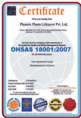
4. ISO 18001:2007 Occupational health and safety management system